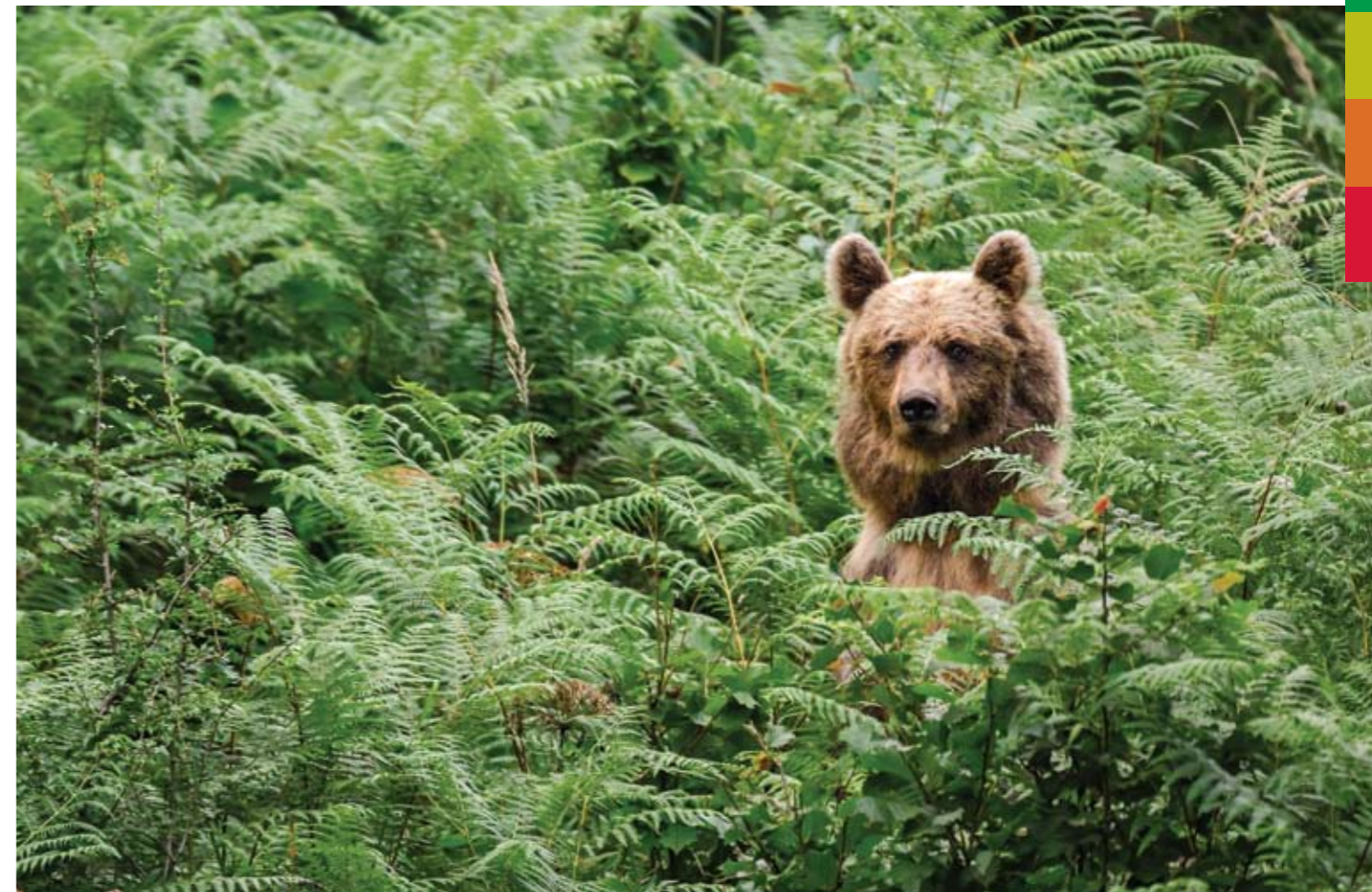
A bear standing on its hind legs is a sign of curiosity. If you see a bear make yourself noticeable

Brown bears throughout Europe (as elsewhere) are known to attack livestock and engage in various other negative human-bear interactions (i.e., property damage, raiding trash, close proximity to human settlements). People are naturally scared of such interactions and often result to killing bears in their defence. There is a need to constantly invest in education, information and law enforcement. Furthermore there is a need to develop fair