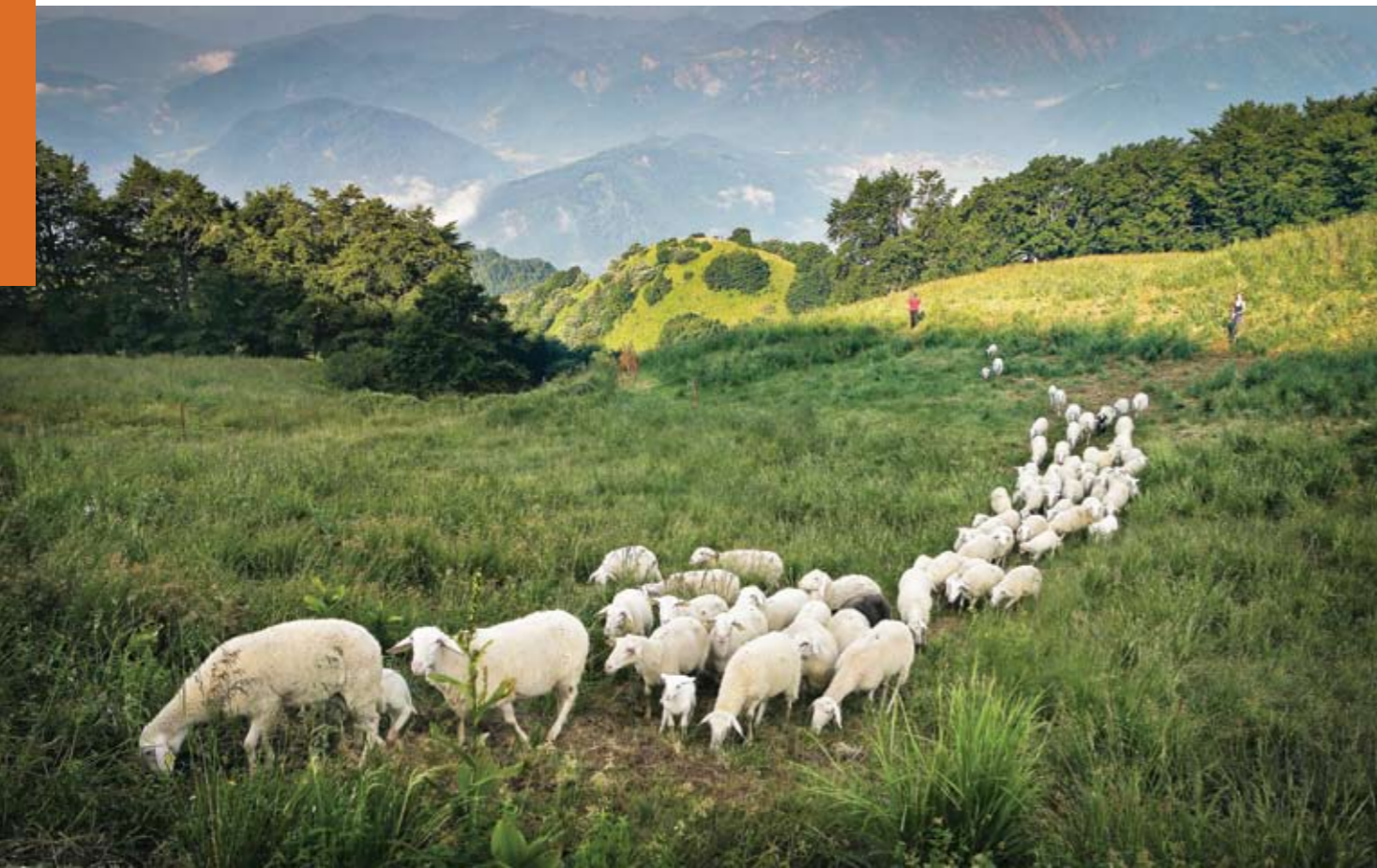
Shepherding as a unique experience for tourists

shepherding is slowly fading away, it would be essential to set up this kind of tourism product in cooperation with an organization that could facilitate the cooperation with trained shepherds. In such a “coexistence” product, the trained shepherds would coordinate, educate and involve tourists in the life and daily work of a shepherd: tourists would participate in the daily shepherd routine, focusing on the work carried out to prevent depredations by large carnivores. It is recommended that other local activities, such as hiking, biking, producing cheese, herbalism etc. are also offered to the visitors. Products that are manufactured in a bear-friendly way and marketed with a “Bear friendly” label can also get an important position in the domestic and foreign market. However, the “Bear friendly” label is more than just a marketing tool: it is about tolerance and coexistence between bears and people.