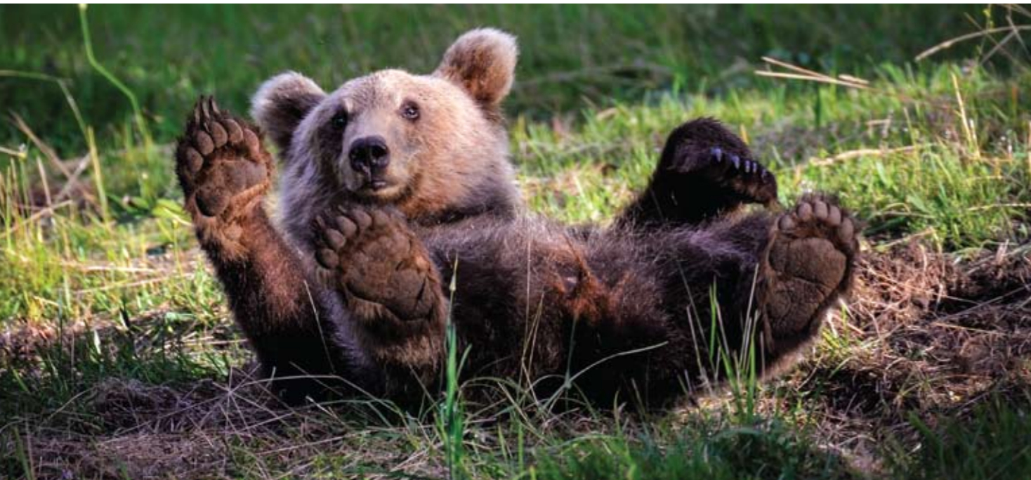
Areas rich in biodiversity have higher tourism value

The non-consumptive use of wildlife, and bears in particular has been practiced for a couple of decades already in North America but is relatively new in southern Europe, where several healthy bear populations still remain. These guidelines were prepared to introduce the concept of the non-consumptive use of bears in tourism in the northern Dinarics and to set specific recommendations for the development of different non-consumptive products.