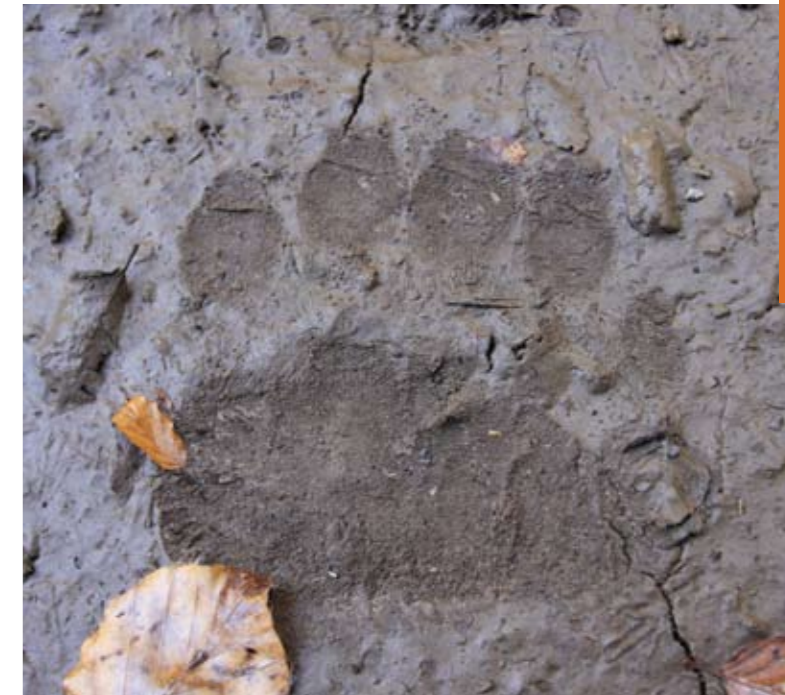
We can look for bears' foot prints along the bear trail (Photo: S. Reljić).