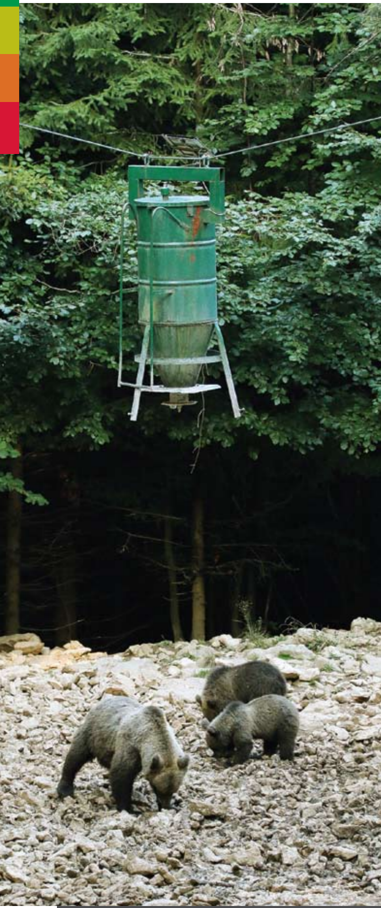
Bears feeding at the feeding site