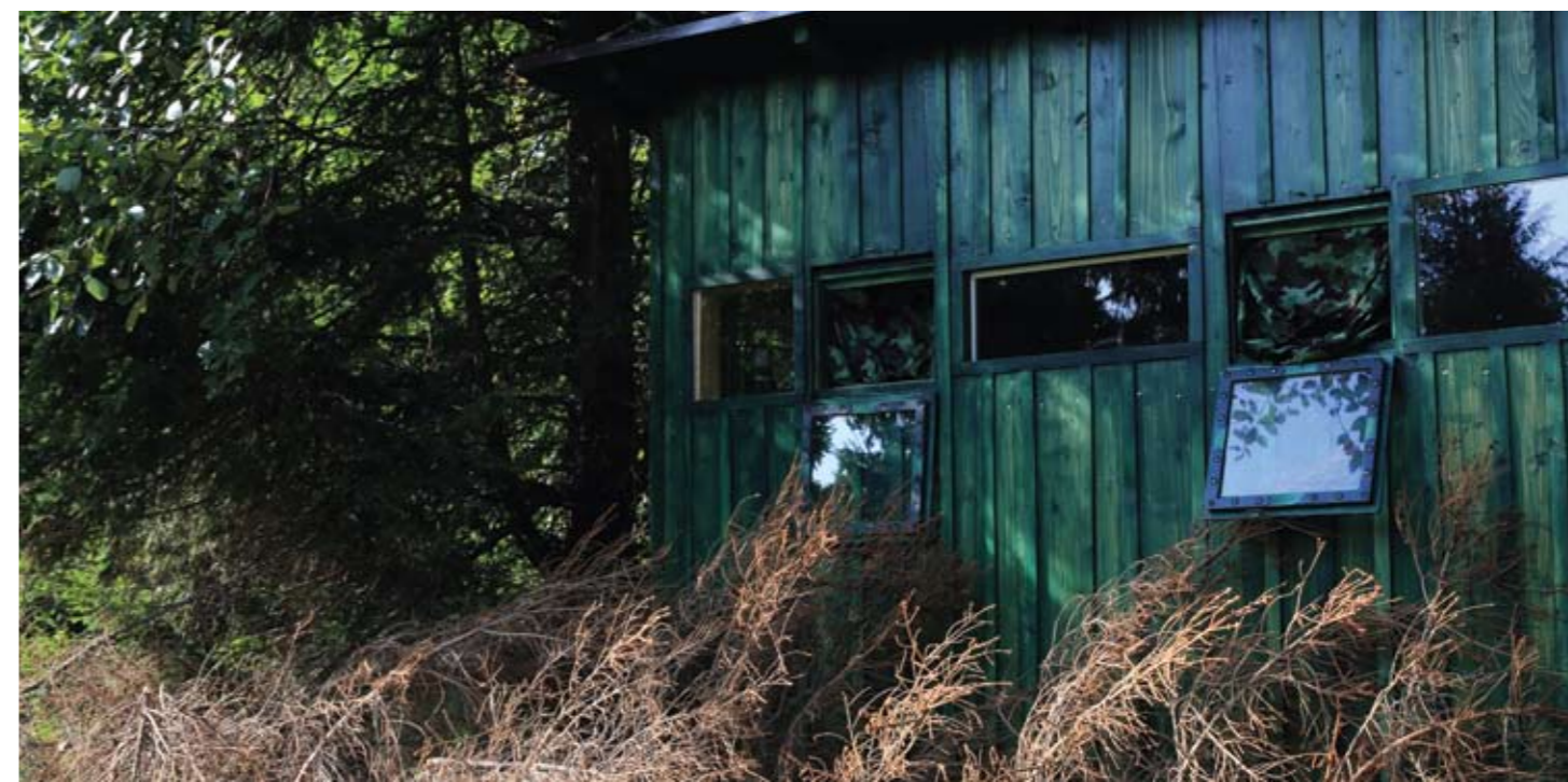
Hide for bear photography

Wildlife hides should comply with existing nature conservation and safety regulations, be in accordance with good building practice and constructed to be durable, safe, accessible, and well suited to the surrounding environment and designated activity. The location and positioning of a hide will be instrumental in