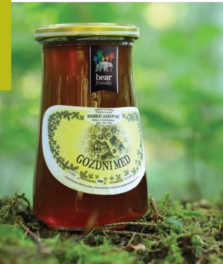
"Bear friendly" forest honey from an apiary protected by electric fence

Based on these results and considering the current social and cultural settings in Slovenia and Croatia we recommend the development of a nature- and bear-related "experience" in the northern Dinarics, consisting of three, distinct products: