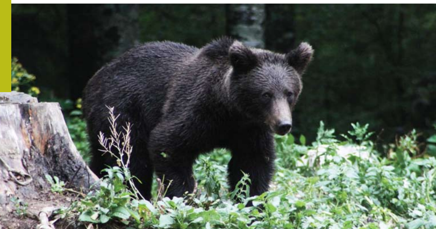
Bears in North Dinarics – new opportunity for local communities?

of Environment and Spatial Planning. In this sense, commercial bear watching and photography following the recommendations outlined in the present Guidelines should not be considered to constitute a disturbance to bears and may therefore be carried out without a special permit.