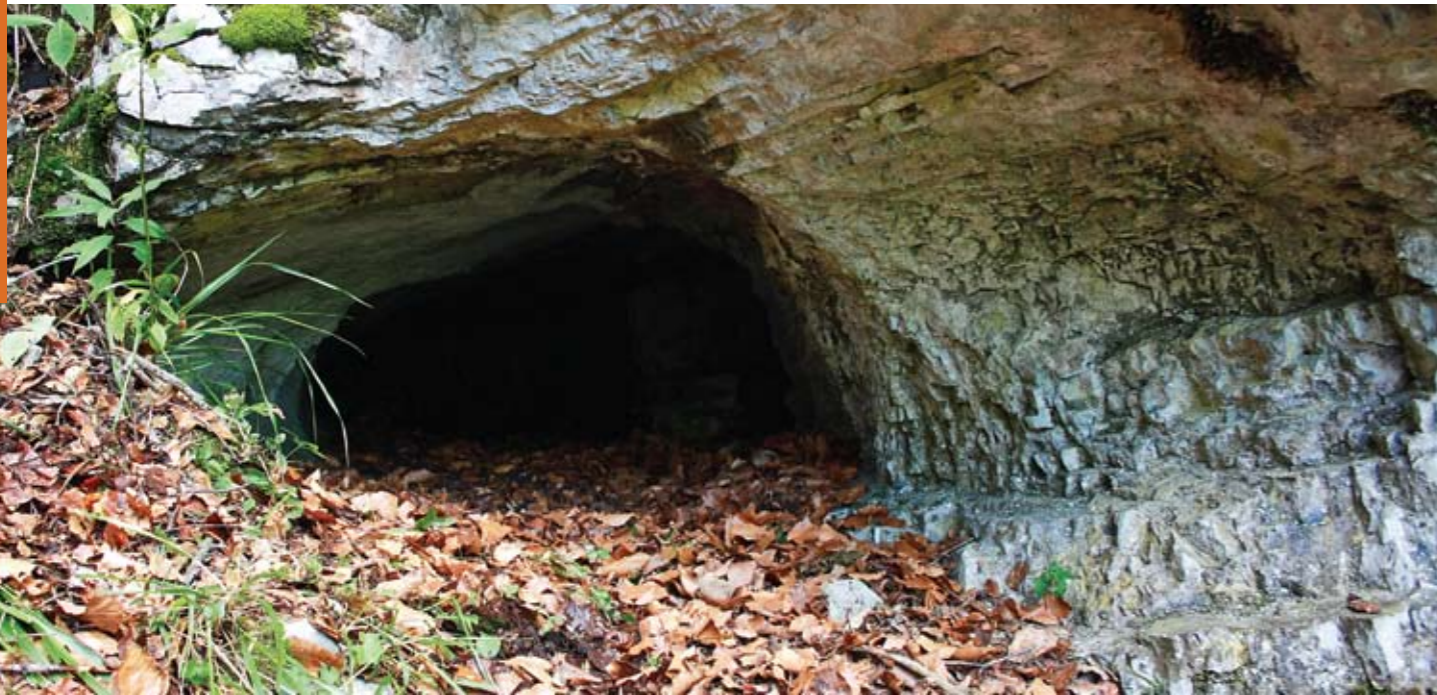
Do not enter the vicinity of or crawl into a bear den