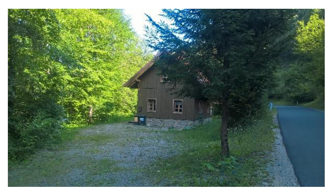
Figure 26: Dislocated house with two individual "bear-proof" garbage cans.