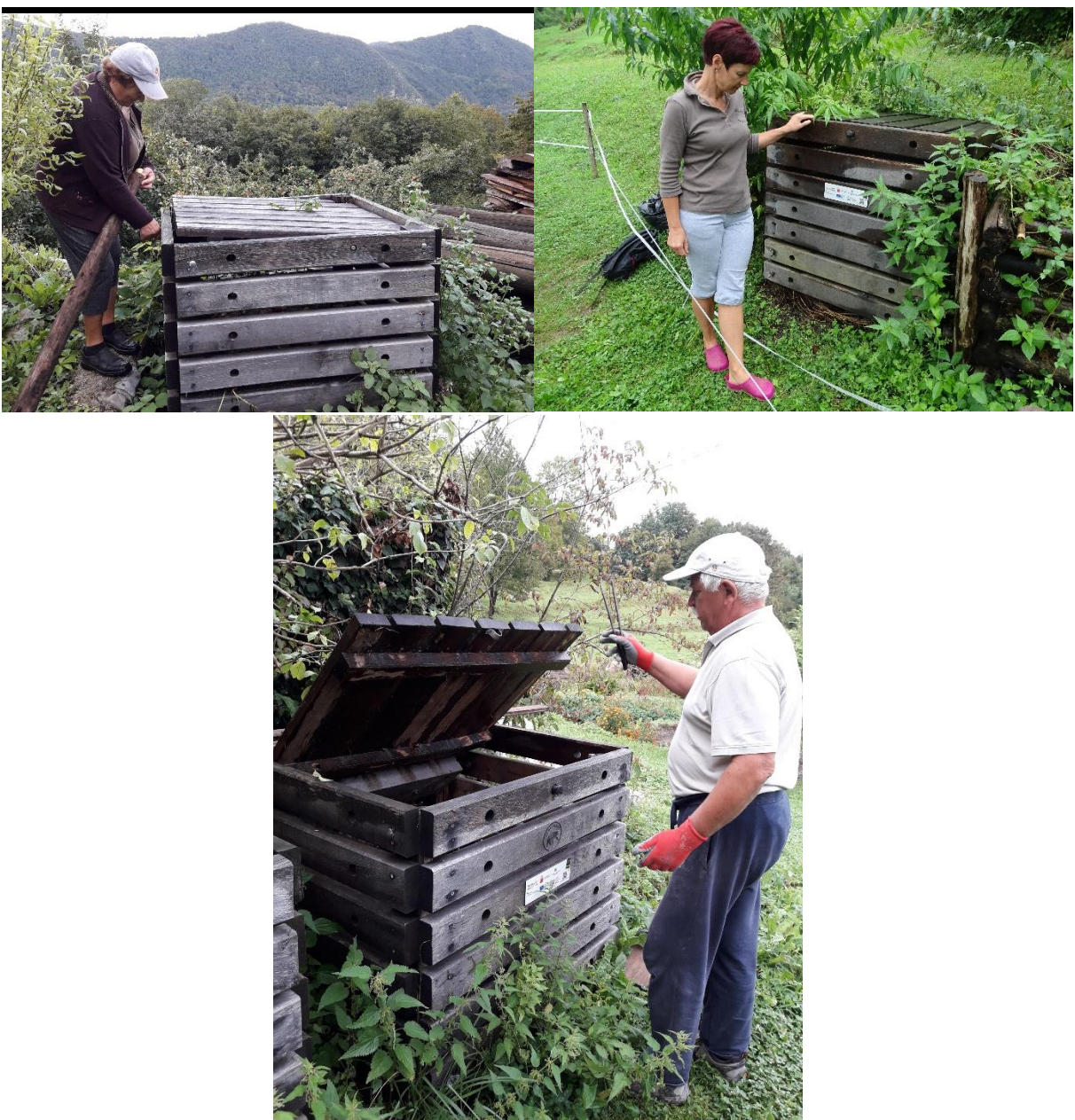
Figure 30, 31 and 32: Satisfied owners of the "bear-proof" compost bins.

During our control visits we only noticed some smaller irregularities: