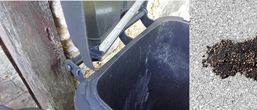
Figure 4: Broken cover of individual garbage can.