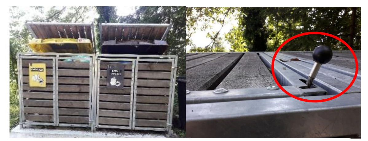
Figure 14: flawless operation of "bear-proof " housings.

Note: besides two "bear-proof" garbage housings for large (~ 1000 litre) containers there is also one additional individual garbage can for waste packaging collection (figure 16) from a nearby farm. This solution did not seem appropriate because the garbage cans near the houses are protected better. We warned the owners and inform them about the importance of the implemented measure location additionally. Afterwards they agreed and moved the trash back to the house.