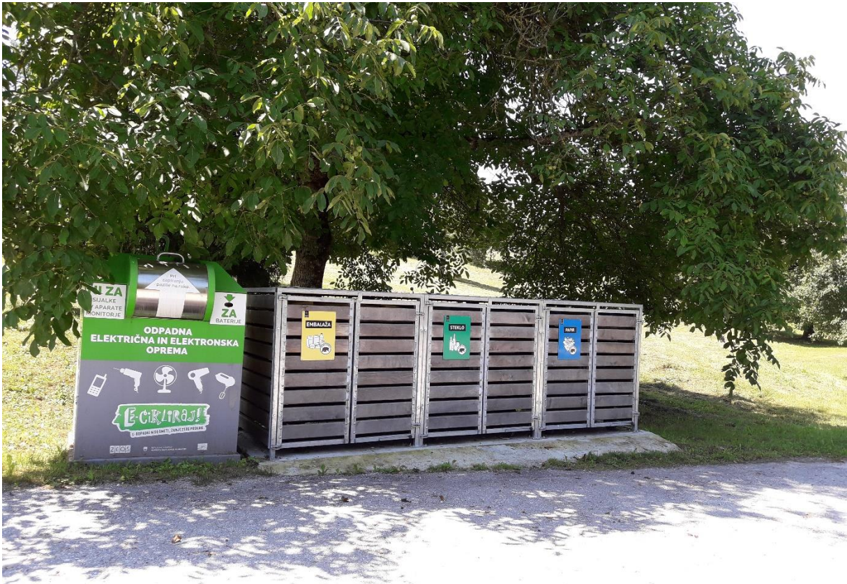
Figure 6: "Bear-proof" garbage housings for large (~ 1000 litre) containers.