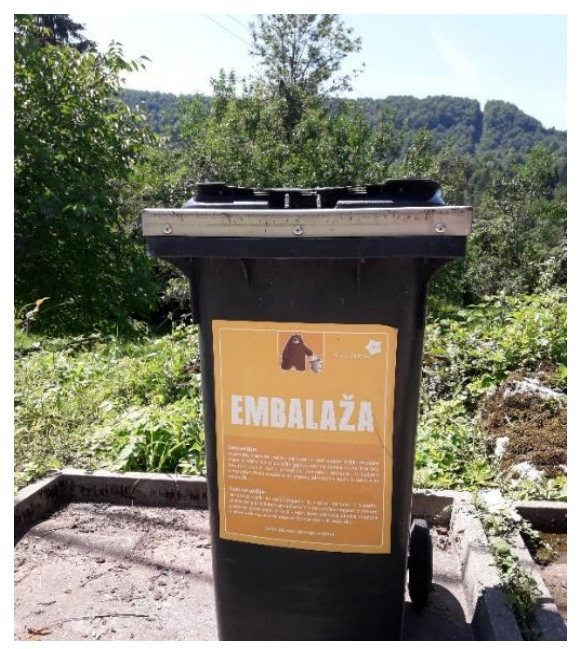
Figure 1: Individual »bear-proof« garbage can for the waste packaging collention.

are undamaged, the bolts are working properly. The use of garbage cans is consistent; all garbage cans are properly sealed. To further protect it, one of the users attached the garbage can with the rope to the trunk of the tree (figure 2), which proves that residents are aware of the importance of the implemented measure and their additional inventiveness. During the control visits we find out that no garbage can was overturned (figure 3). When the individual bear-proof garbage cans were implemented, the local inhabitants reported few occasions, when a bear overturned the garbage cans. In spite of the constant presence of bears and the amount of distributed garbage cans, until now only, only one garbage can was broken (figure 4). This is far above our expectations, based on experience in the Autonomous Province of Trento, where the garbage cans were adjusted in a similar way. It can be concluded that the bears considerably less frequently unload the garbage, since there is no