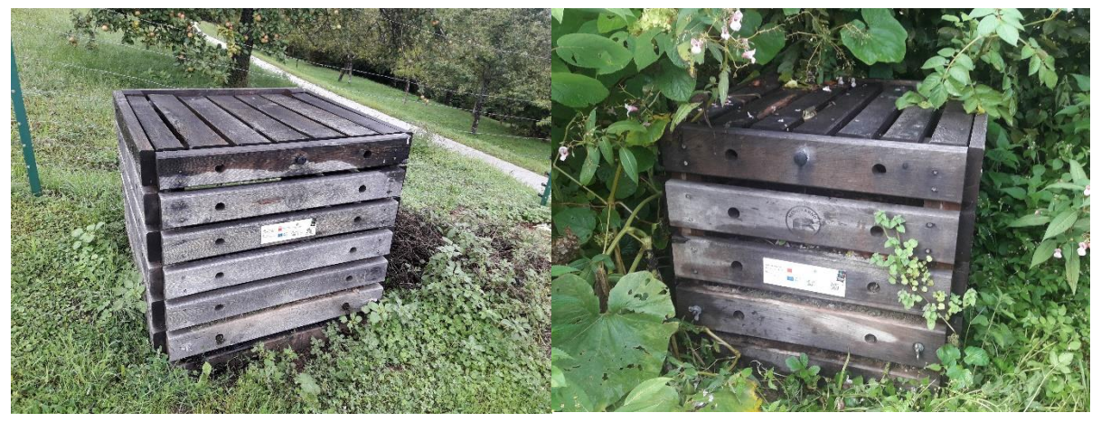
Figure 28 and 29: In general, compost bins are operating flawlessly.

In the municipality of Kostel, the bear-proof compost bins were distributed to the local inhabitants who have the most numerous conflict situations with bears. The general the compost bins are operating good. Also their use is consistent in general (figure 28-29).