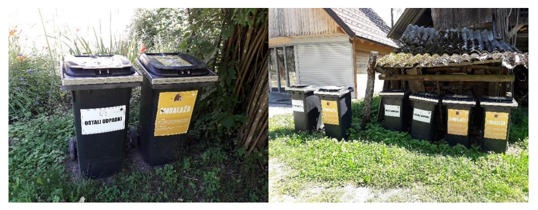
Figure 10: Individual "bear-proof" garbage cans.