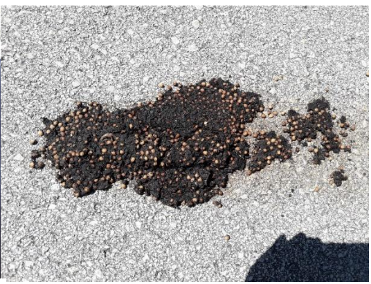
Figure 5: Bear scat, founded in immediate vicinity of the village