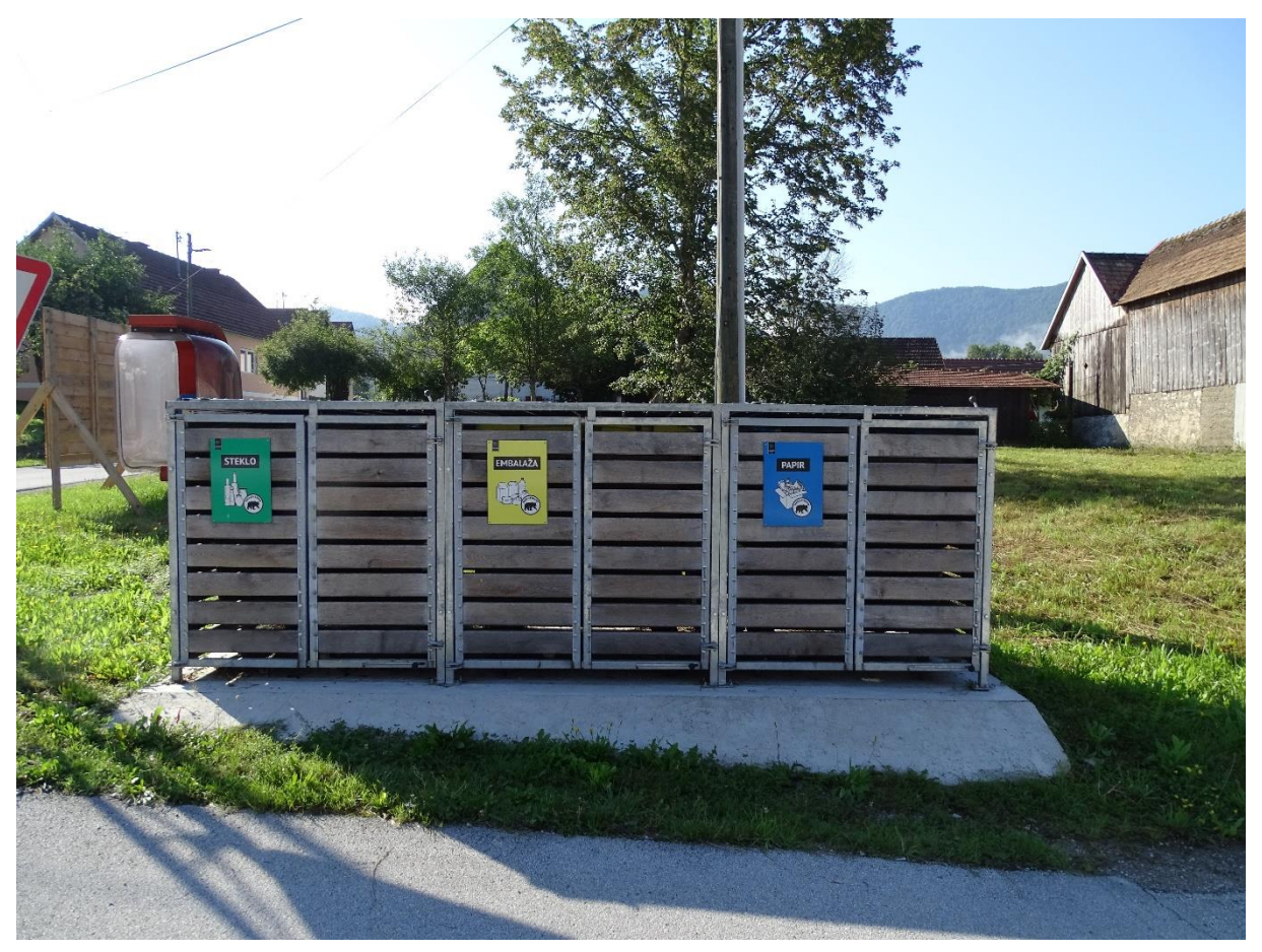
Figure 22: "bear-proof" garbage housings placed In the settlement.

In the settlement Kuželj three "bear-proof" garbage housings for large (~ 1000 litre) containers for various waste were set up (figure 22). Operation and use are found to be flawless (figure 23). During the control visits, we noticed any irregularity in operation and use.