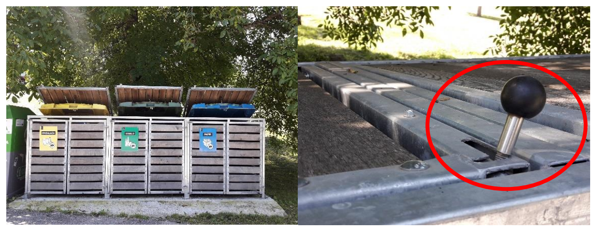
Figure 7: Covers of the garbage containers are properly attached to the cover of the housing – they open simultaneously.

Figure 6: "Bear-proof" garbage housings for large (~ 1000 litre) containers.