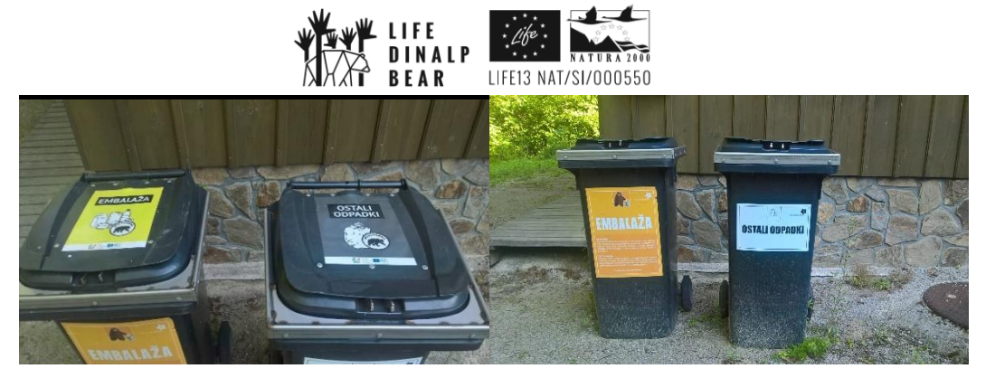
Figure 27: Individual garbage cans are operating flawlessly. The sticker with LIFE and NATURA 2000 logotypes and LIFE DINALP BEAR project acronym is placed on each individual garbage can to inform of its "bear-proofness".