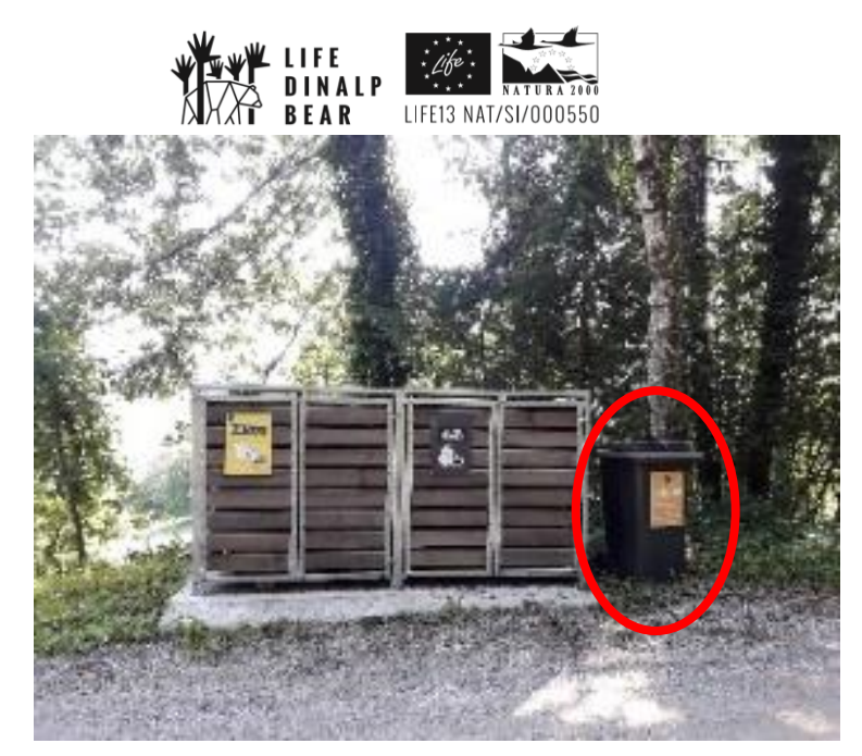
Figure 16: Additional individual garbage can on the location.