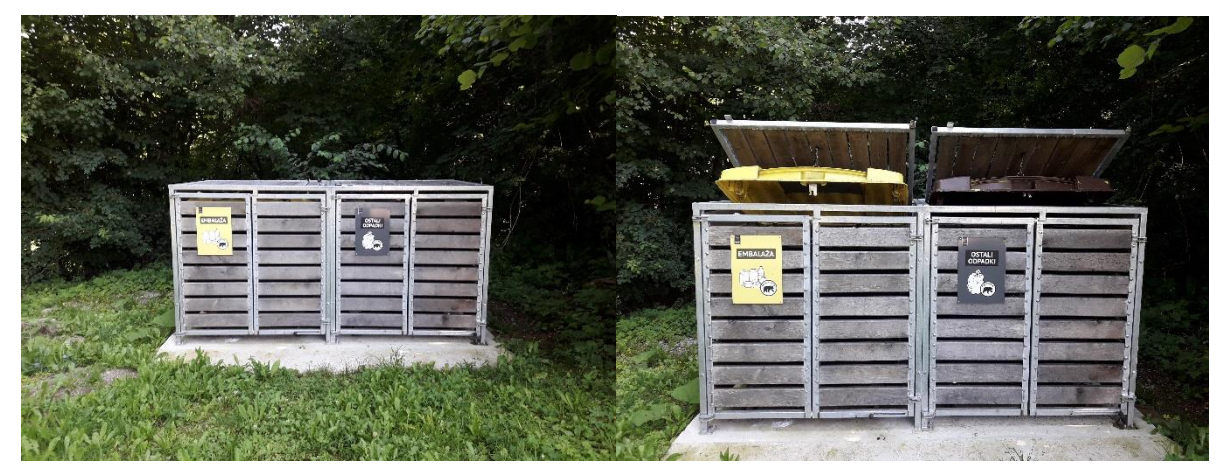
Figure 18: proper operation of the "bear-proof" housings.