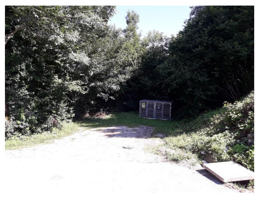
Figure 17: "bear-proof" garbage housings for large (~ 1000 litre) containers location.

At the nearest vicinity of the castle Kostel (Figure 17), two "bear-proof" garbage housings for large (~ 1000 litre) containers are located. They are intended for the protection of collective garbage cans, for the collection of mixed packaging and mixed municipal waste. During control visits we find no irregularities in the operation and also use of the enclosures (Figures 18 and 19).