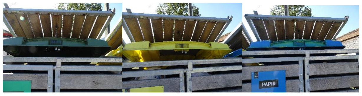
Figure 23: covers of the garbage containers are properly attached to the cover of the housing – they open simultaneously.