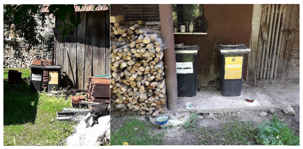
Figure 12: individual "bear-proof"Figure 13: individual "bear-proof" garbage cans.garbage cans.