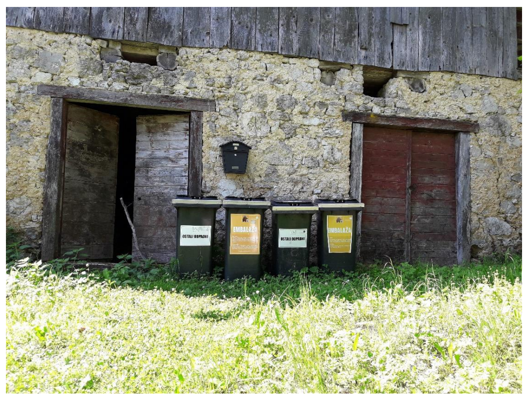
Figure 9: Individual "bear-proof" garbage cans.

Also at this location, all twenty-two houses are equipped with individual garbage cans (figures 9-13). During control visits, we did not notice any special features in the use and proper operation of the garbage cans. All covers are closed correctly. Before the implementation of the measures, garbage cans were unloaded by bears accessed repeatedly. Now the bear-proof garbage cans are intact. Some of the recipient close garbage cans into the interior spaces, because they do not permanently live in the village and want to protect them additionally. Since we cooperate, recipients are even more attentive to the proper use and even additional protection, what demonstrates the awareness of the implemented measure importance and the effectiveness of our efforts to raise the awareness.