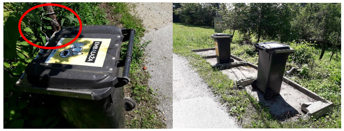
Figure 2: Garbage cans, attached to the tree

food "reward" available. On several occasions, bear scats (figure 5) were found in the vicinity, which points to the bear presence, relatively close to the village. Regardless, locals report less bear encounters near the houses than before the prevention measure implementation.