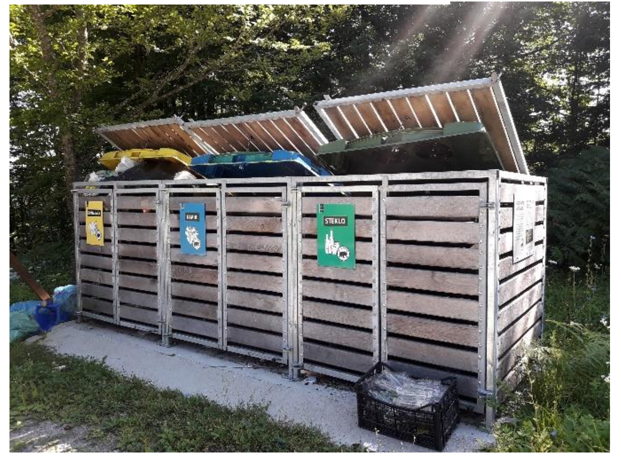
Figure 21: bottles are placed in a PVC box right next to the glass garbage can enclosure.