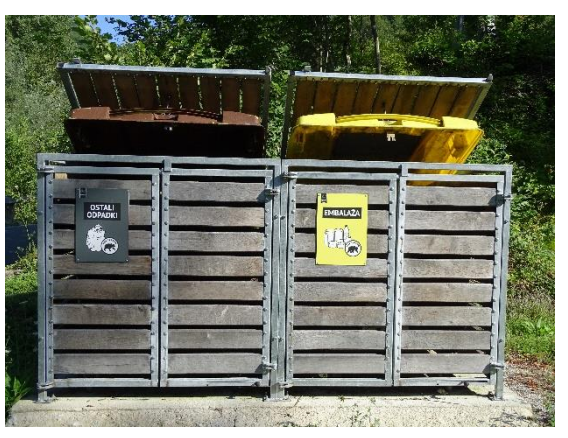
Figure 25: Flawless operation of "bear-proof" garbage housings for large (~ 1000 litre) containers.

The operation of the garbage cans enclosures (figure 25) as well as the individual garbage cans (figure 27) is without irregularities. Also use is proper and with no noticed failures.