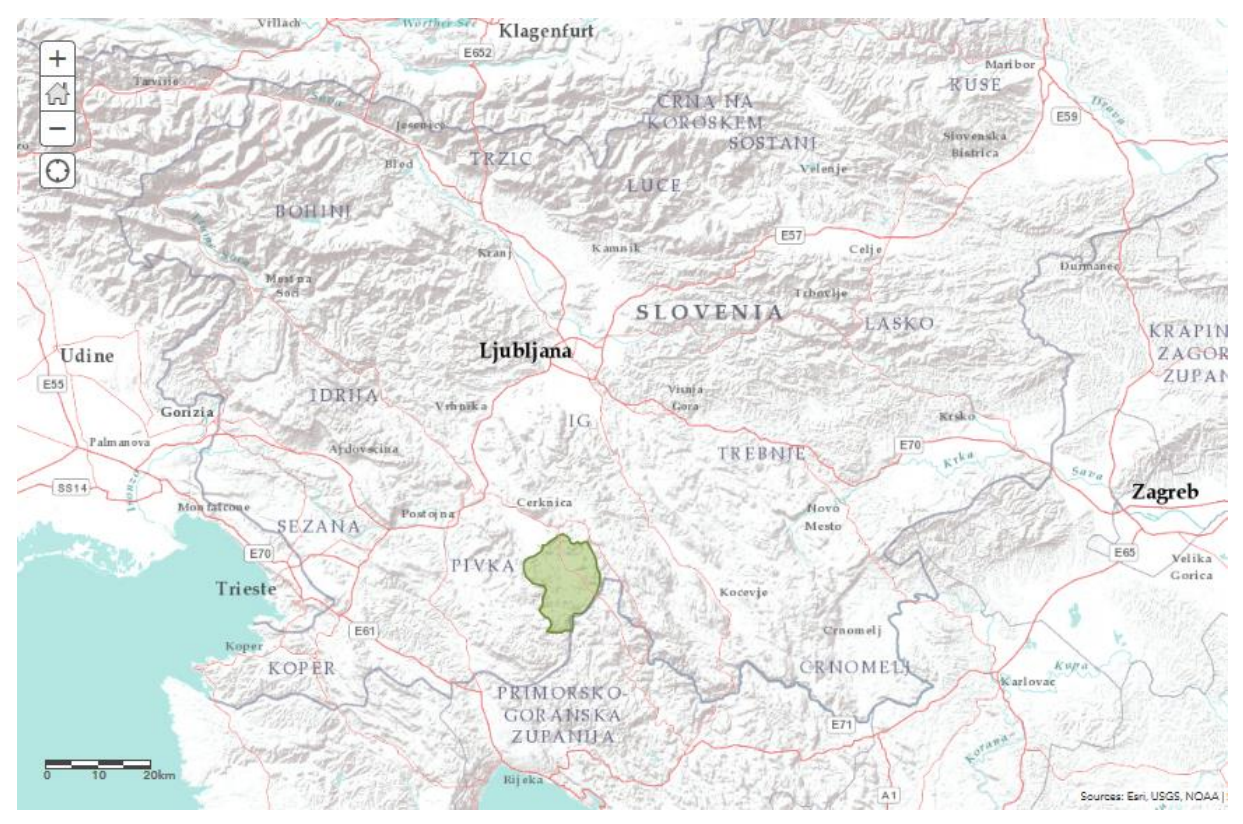
Map 1: Location of the municipality of Loška dolina in Slovenia (in green).

In the municipality of Loška dolina (see map 1) bears often come to the nearest vicinity of the settlements. One of the most attractive is the area at the eastern part of the city Stari trg pri Ložu, named Ograde. This settlement is surrounded by forested area. The most numerous conflict situation occurs in the street in the immediate vicinity of the forest. For that reason, in this area we installed the bear-proof individual garbage cans. The implementation of the measure was carried out in close cooperation with the municipality of Loška dolina.