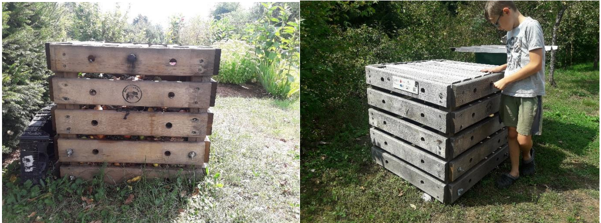
Figure 3-6: good operation of the »bear-proof« compost bins.

During our control visits we only noticed some smaller irregularities: