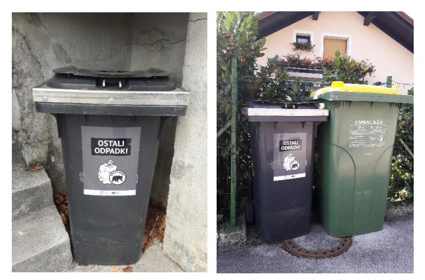
Figure 1 and 2: Individual »bear-proof« garbage cans for mixed municipal waste collection. All of the garbage cans are equipped with a sticker with LIFE and NATURA 2000 logotype and LIFE DINALP BEAR project acronym, to provide information about their "bear-proofness".

the garbage cans but do not succeed in opening it. Because they do not access the contains of the garbage cans, in general they are not interested in overturning it anymore. For us, this is an additional approval that implemented measure effectively deterrent bears from human settlements.