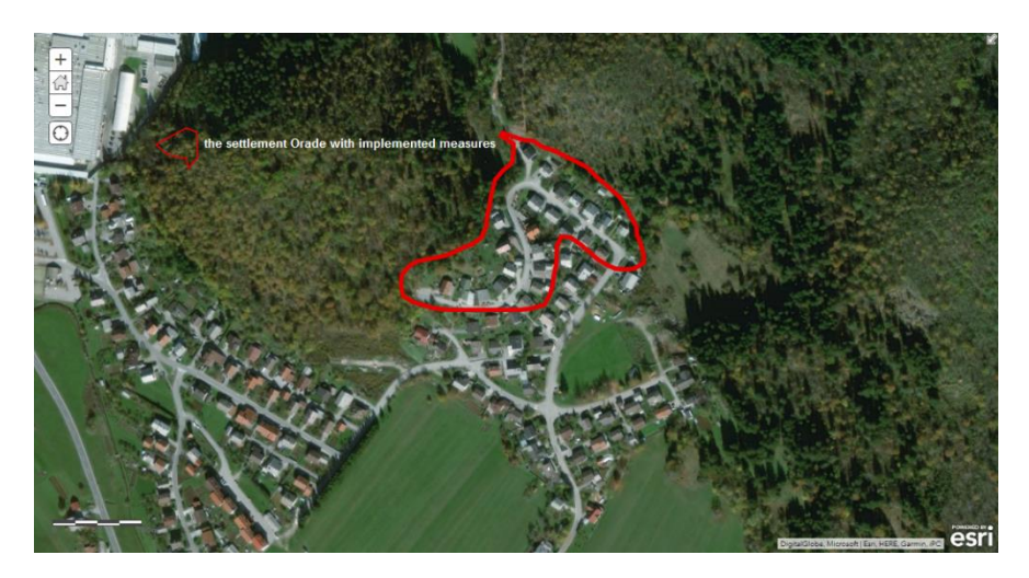
Map 3: Ograde, the area where the individual garbage cans and compost bins were distributed.